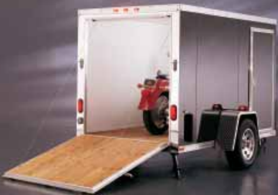
Model SS5101-MT3V (1-Place)

Lightweight, low-maintenance and way beyond ordinary, the SILVER SPORT lets you break free from the pack.